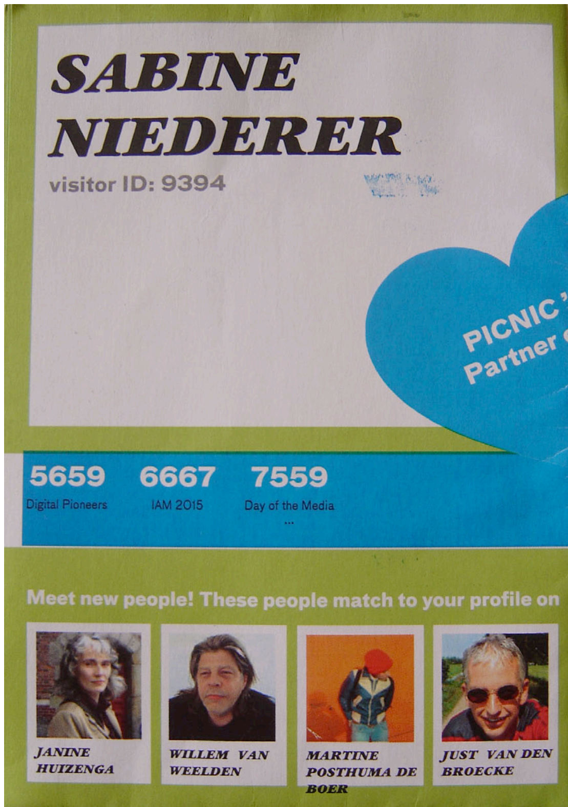
Figure two: Attendee badge, with interest profile matching for social networking, Picnic '07, Amsterdam.