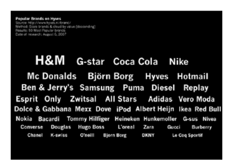
Figure four: Word cloud of the most referenced interests across the entire social networking platform Hyves, Govcom.org Foundation, Amsterdam, 2007.

Should post-demographics emulate the Nielsen machines and metrics? Are there post-demographic equivalents to the machines and their metrics? Indeed, one may transfer the counting method from TV audience research to social net-working sites, using the available interest fields as well as basic demographic data (gender, age and location). Thus one may tally references to a particular interest across an entire social networking platform, as colleagues and I did for Hyves in the Netherlands in 2007 (see figure four). (No demographic data were used in the example.) Among the types of favorites at Hyves are brands, and Hyvers, as the users are called, fill in that field, albeit often without the care and diligence that would be demanded of a Nielsen family member.