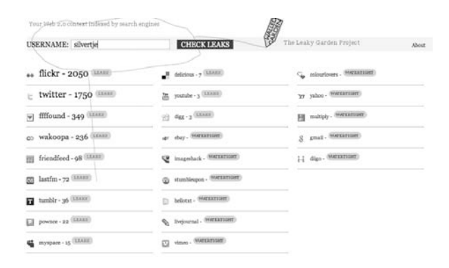
Figure three: Username service subscription profile of 'silvertje' (Anne Helmond), including the 'leaks', or the amount of silvertje references per service, indexed by Google. Leakygarden.net, Govcom.org Foundation and the Digital Methods Initiative, Amsterdam. 2008.

Here the question concerns, just how walled are these gardens? Apart from examining the data flows between applications, as above, the question of the permeability and penetrability of the platforms also may be approached by examining whether and to what extent each is indexed by search engines. In order to do so, leakygarden.net sits atop a machine that checks the availability of a particular username across a growing list of Web 2.0 applications. Usernamecheck.com is a useful service. When considering a new username, you may wish to know if and where it is taken, across the broader landscape of platforms. Here usernamecheck.com is repurposed, and in the first instance made into a profiling machine. Type in a username and check which services a person uses. Here the project researchers observed that generally speaking people seem to have two usernames, an alias as well as the real name (first and last name) as one word. Thus one may need to perform two queries for a fuller picture. Subsequently, leakygarden.net looks up references to the username. Does Google return pages from that username per platform? In all, the Leaky Garden Project shows which 'walled gardens' leak, and which are watertight (see Figure three).