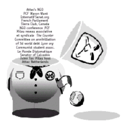
Actors in "French Farmers Protest" Network on the Web.