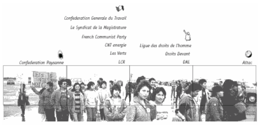
Actors in "French Farmers Protest" Media Story

We turn to our home-made netlocator (a piece of software) to find out whether an authoritative network is disclosed by these starting points. If it locates such a network, the netlocator would give us an indication of the degree to which the streets are still romantic, still French. With the netlocator serving as our medium, the Web is asked to either remake or unmake the various spectacles brought to us by CNN, BBC World, de Volkskrant and tout.lemonde.